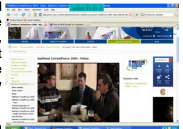
The DVD is ready for viewing

We have recently made some great additions to the online resources we offer registered clubs to help with their NatWest CricketForce event planning. First and foremost we are pleased to announce that the NatWest CricketForce 2008 DVD is available to view on ECBtv, just click here or go to www.ecb.co.uk/natwestcricketforce and look for the link on the left hand side. This DVD shows clubs a step by step guide on how to organise your CricketForce event using the example of Kirby Muxloe Cricket Club, Leicestershire, who constructed a new pavilion as well as making other improvements around their ground.